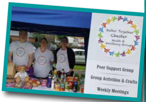
Picture Caption: Members of the Better Together Chester wellbeing group.

"Our members constantly tell us how they enjoy being in a kind-hearted, approachable atmosphere where they feel welcome, safe and totally at ease."